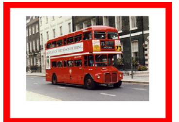
September 1989 - Bedford Square