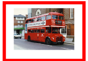
March 93 - Euston Churchway