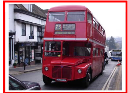
RML2666 in St. Albans, driven by its present owner [2005]